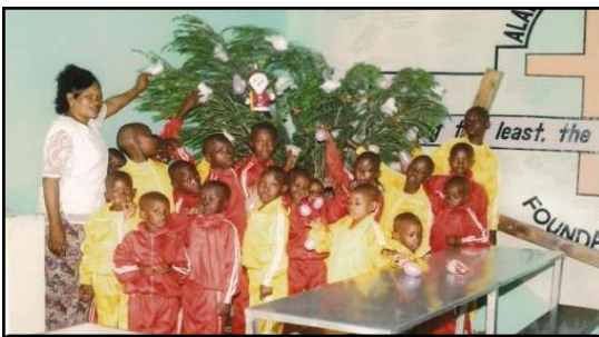
DECORATING CHRISTMAS TREE