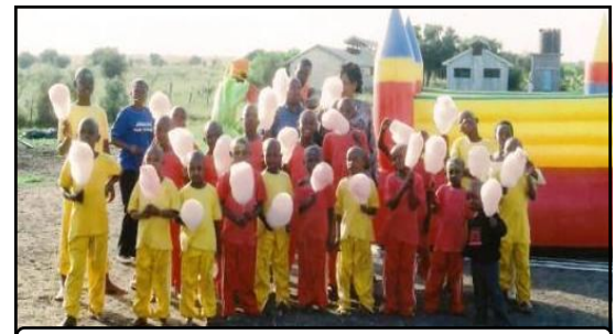
ENJOYING COTTON CANDY