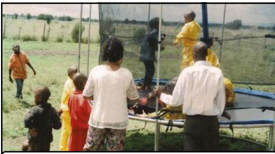
JUMPING ON TRAMPOLINE