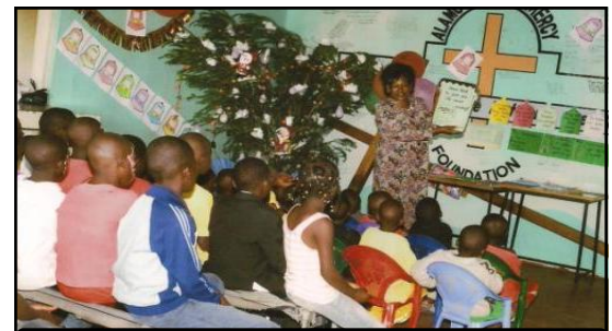
LISTENING TO THE CHRISTMAS STORY