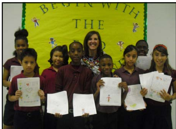
WALKER INTERMEDIATE SCHOOL