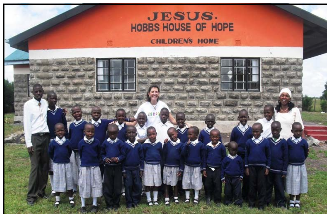
HOBBS HOUSE OF HOPE ACADEMY