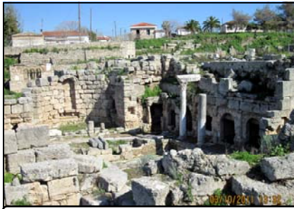
RUINS OF CORINTH—GREECE