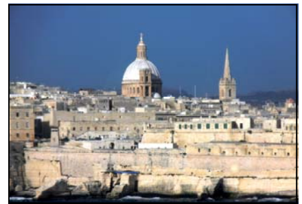
ISLAND OF MALTA