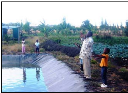
PRAYING OVER PONDS