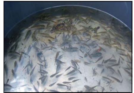
TILAPIA AND CATFISH