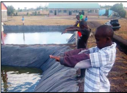
ASKING GOD'S BLESSING