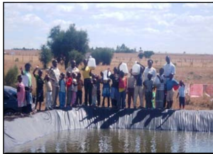
PREPARING TO RELEASE