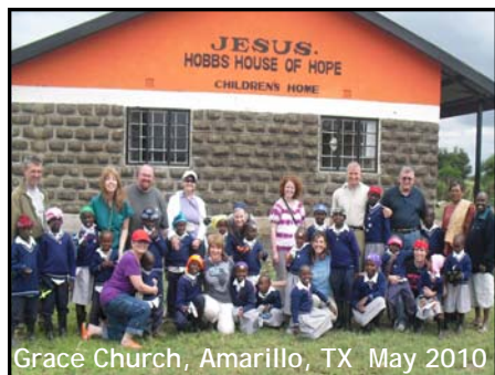
Grace Church, Amarillo, TX May 2010