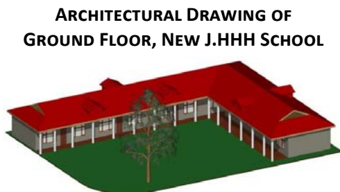
ARCHITECTURAL DRAWING OF GROUND FLOOR, NEW J.HHH SCHOOL