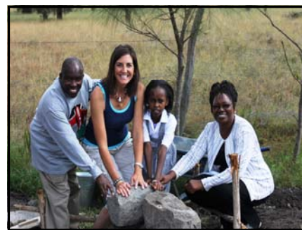
LAYING THE CORNERSTONE

On Monday, June 11, faith became sight as we broke ground for our new school building!