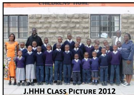
J.HHH CLASS PICTURE 2012