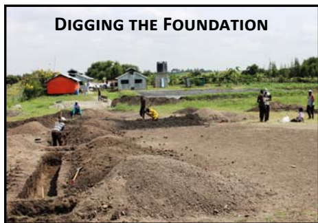
DIGGING THE FOUNDATION

We will begin by constructing one floor consisting of six classrooms. Our prayer is that construction be completed and classrooms furnished by January 2013, in time for the new school term. The initial construction cost of the ground floor totaling 4,210 sq.ft. was $117,000. The Lord has already blessed us by providing for the entire cost of the foundation! Now the remaining funds needed to complete the school is approximately $85,000. Please pray and consider helping build our new school. If you would like to assist with this project, designate your tax-deductible gift “School.” Thank you.