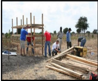
Building Rabbit Hutches...

In addition to constructing two rabbit hutches on our property, we conducted medical camps and basketball clinics which had over 2000 kids in attendance! We were able to hand out new shoes to orphans as well as serve them a hot meal after a church service. We also walked a 12 foot cross through the slums of Nairobi, sharing the Gospel with hundreds of people who stopped to listen.